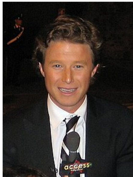
Billy Bush was recorded having "an extremely lewd conversation about women" with Trump in 2005.

During the second debate, Anderson Cooper asked Trump if he understood that he had bragged about sexually assaulting women. Cooper used the Justice Department's sexual assault definition to include "any type of sexual contact or behavior that occurs without the explicit consent of the recipient". [119][120] Trump denied having said that he had sexually assaulted women. [120][121] He claimed the comments were merely "locker room talk", then, after being asked three times whether he had ever kissed or groped any person without consent, he said "no I have not". [121] Several of his subsequent accusers said this was the moment at which they were motivated to come forward. [122][123][124]