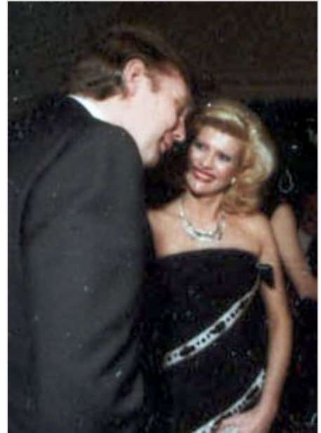
Ivana and Donald Trump in 1985

In October 2016, two days before the second presidential debate with Hillary Clinton , a 2005 "hot mic" recording surfaced in which Trump was heard bragging about kissing and groping women without their consent, saying that "when you're a star, they let you do it. You can do anything. ... Grab 'em by the pussy." [8] The incident's widespread media exposure led to Trump's first public apology during the campaign [9] and caused outrage across the political spectrum. [10]